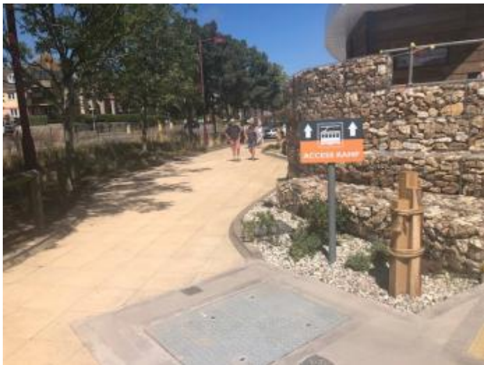
On approach to the front of the Station. Signs direct you to the access ramp to the side of the building.