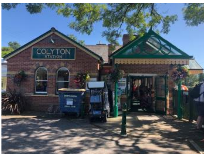
Entrance to Colyton Station from accessible parking. To get here please follow signs for 'Main Entrance'