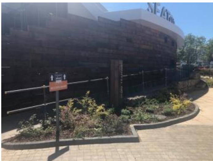
The start of the ramp at the side of the building.