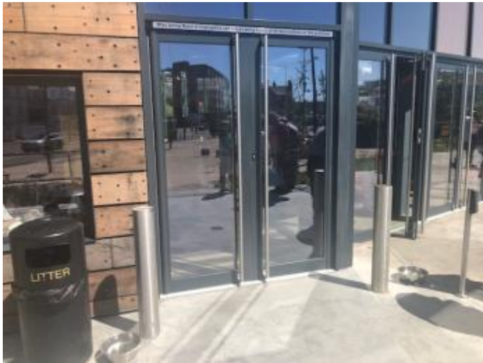
Main entrance to Seaton Tramway

Our 'Automatic & Button' operated door has a max width of 1800mm All other manual doors at entrance have a max width of 1800mm