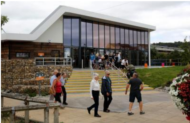
Front of Seaton Station, showing stepped access.