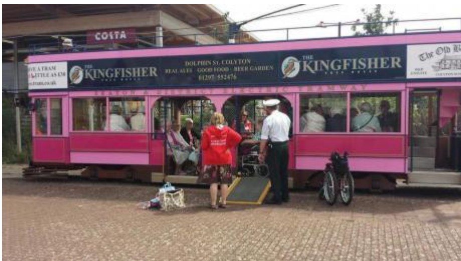
Tram 11 (pictured) Tram 9 & Tram 10. All have disabled accessible bays which are accessed by portable ramps. The wheelchair bays

Tram 9, 10 & 11, All have disabled accessible bays which are accessed by portable ramps. The wheelchair bays on Trams 10 and 11 are open-sided, therefore are open to the elements. The wheelchair bay on Tram 9 is enclosed.