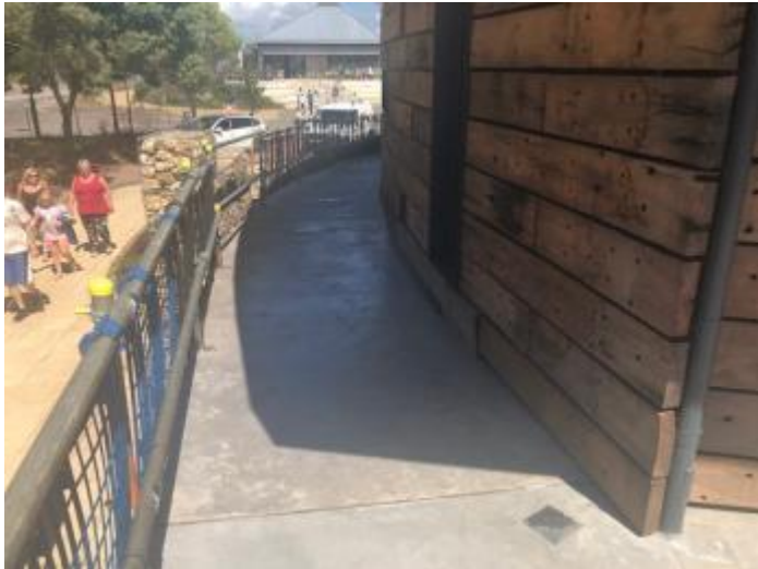
Ramp going down on the west side of the building from the main entrance.