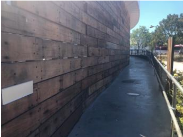
The Ramp going up