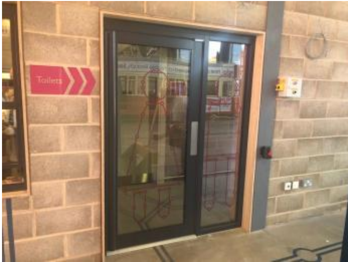
Door to toilets - including accessible toilet - from main tram hall.