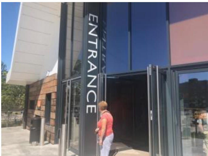
Automatic door directly next to main foyer entrance doors. Operated with push button. Located next to the entrance sign