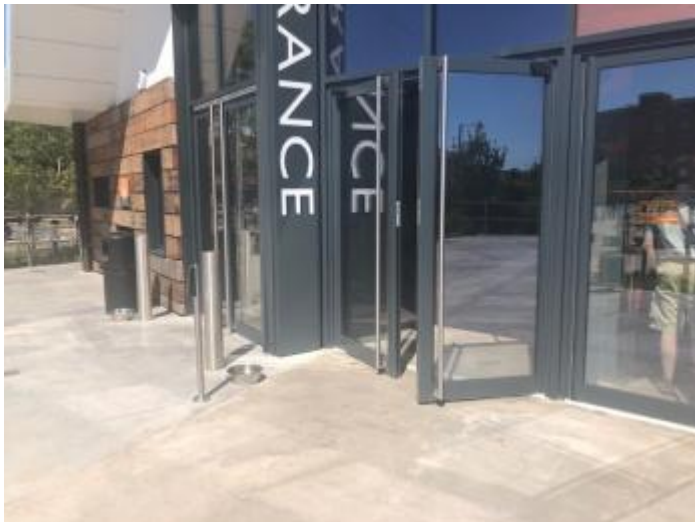
Automatic door directly next to main foyer entrance doors. Operated with push button.