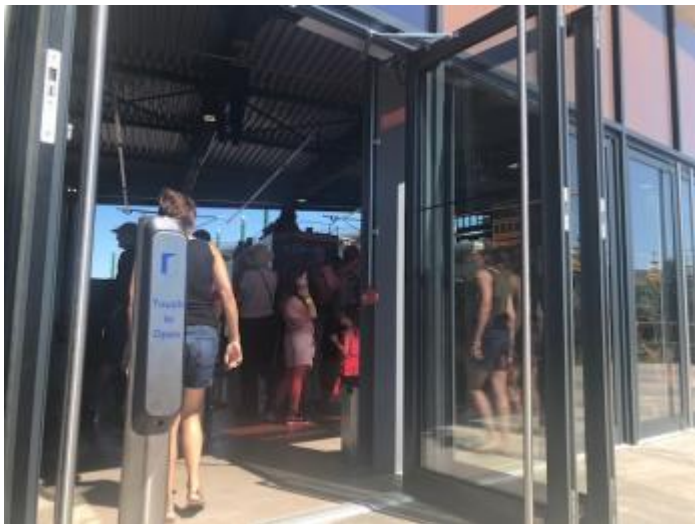
The Automatic entrance doors to the Station. 1800mm.