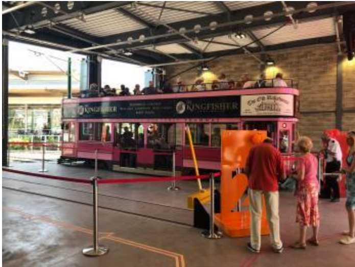
Inside Seaton Station.