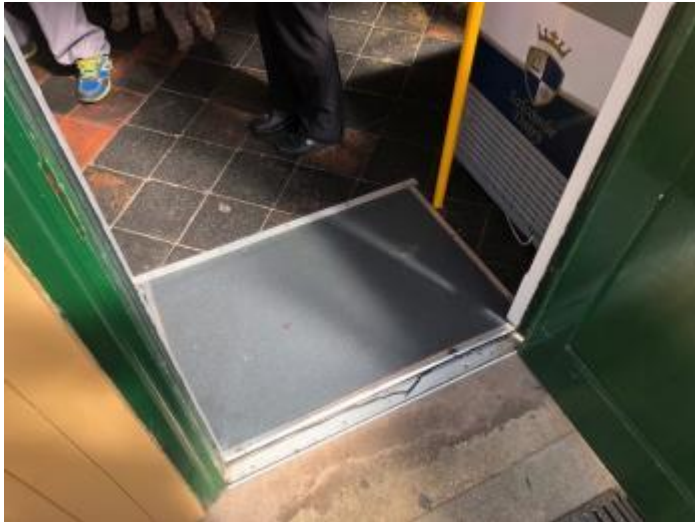
Small ramp through the door from Platform to Colyton Cafe