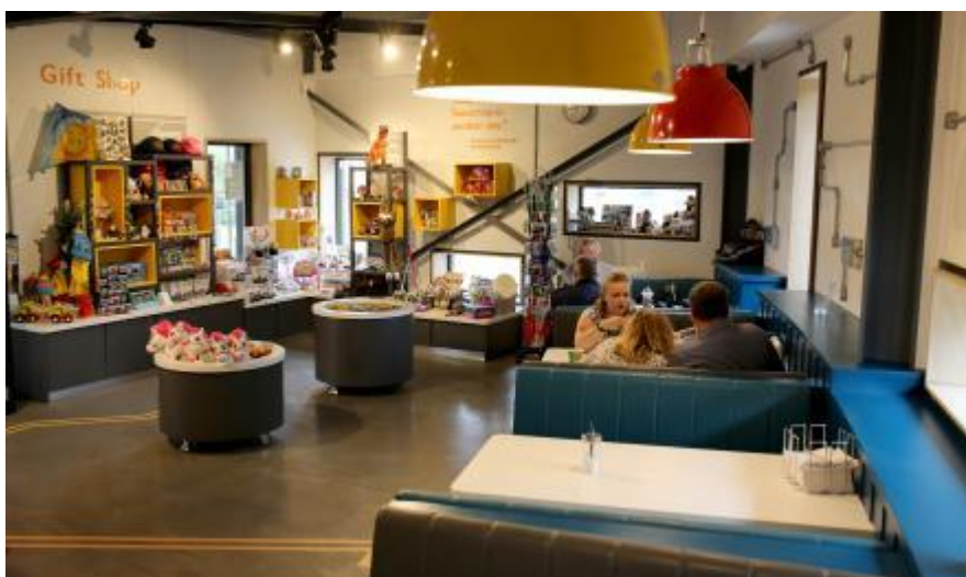
Gift Shop and Café – need photo and text e.g. There is a gift shop and a café in Seaton Station. In the café, there is banquette