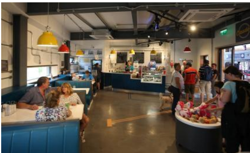
Full view of Seaton Stations, Claude's Cafe & Gift Shop