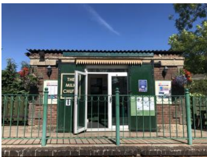
This is the Milk Churn Gallery. Inside there is information about the old branch line and the Victorian station