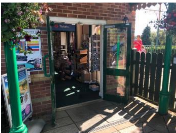
Entrance to Giftshop and Tickets and Station. 1300mm