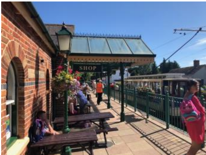
Colyton Platform, with picnic benches.