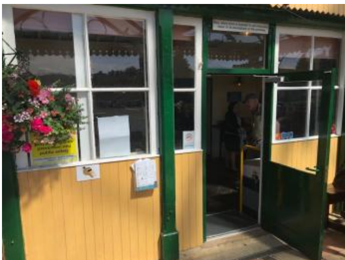
Access to Cafe & and Gift Shop from Colyton Platform.