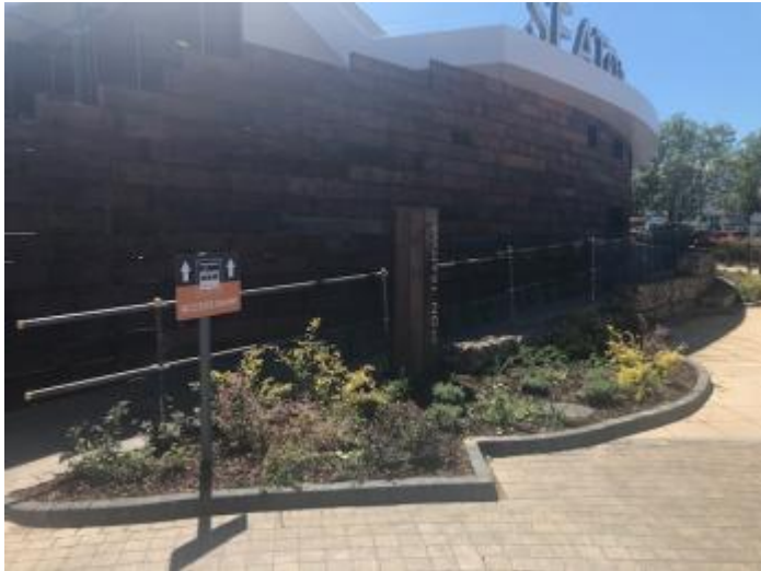
Access ramp on the west side of the station. You will see this if you come from the Underfleet Car Park.