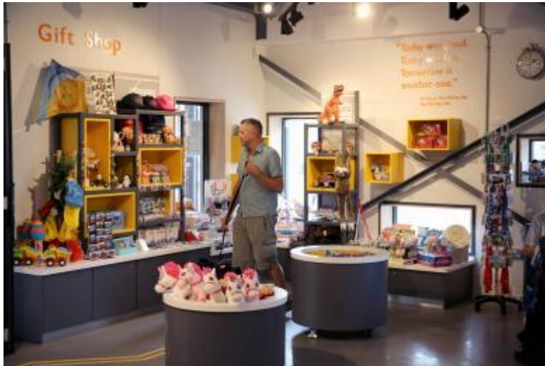
Claudes Gift Shop at Seaton Station